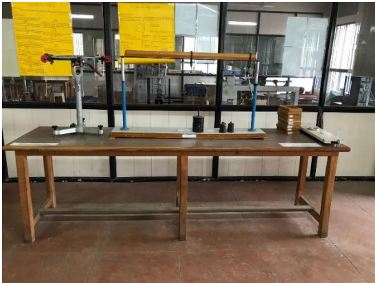
SIMPLY SUPPORTED BEAM