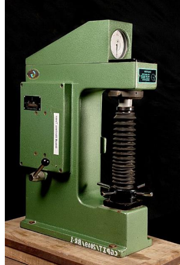
BRINELL HARDNESS TEST