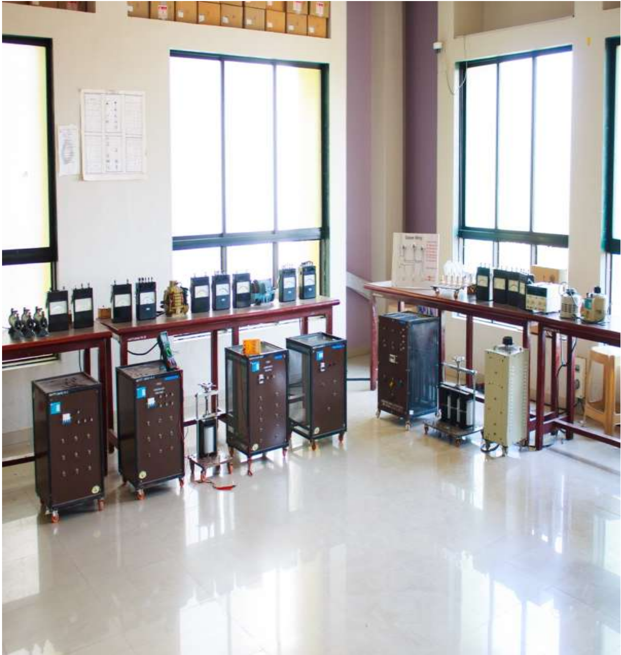
This image shows single phase variable ac source ,three phase variable ac source , DC regulator battery, multimeters, ammeters, voltmeters, wattmeters, resistive load , choke coil, DC motor and godown wiring.