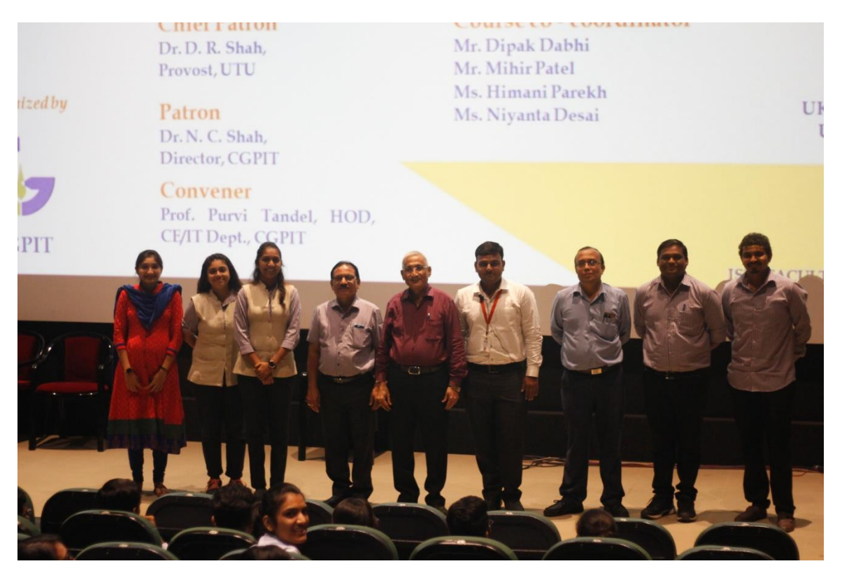
Group photo with director, head of department and coordinators