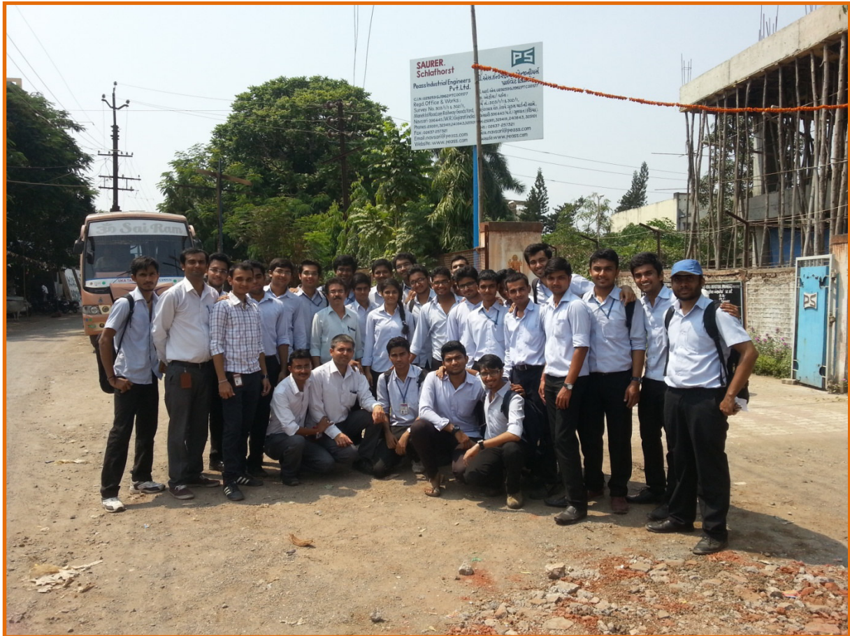
A Group Photo – Visit at Peass Industrial Engineers Pvt. Ltd., Navsari ( 04-10-2014)