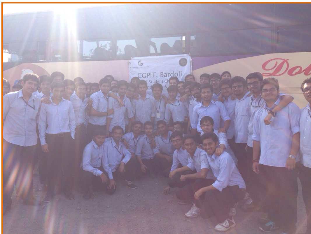
A Group Photo – Visit at Ukai Hydro Power Station

An Industrial visit to Ukai Hydro Power Station was organized by CGPIT College as a part of the ISTE Student chapter activities.