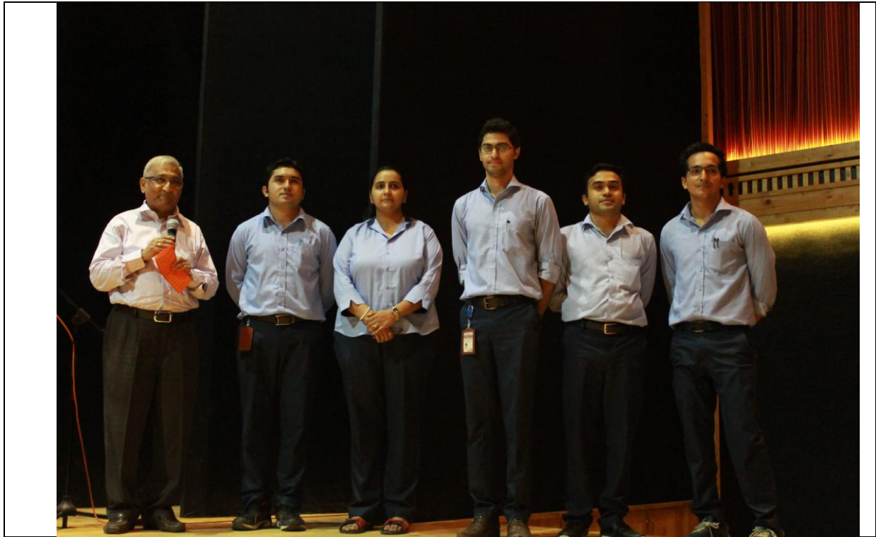
k. Expert delivering talk