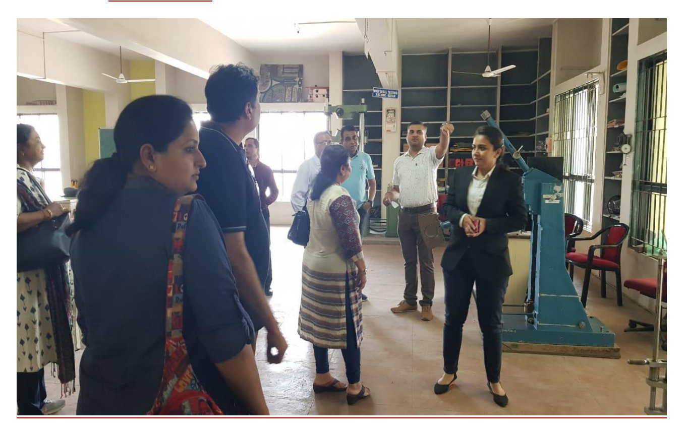
3. <u>Bosch Lab</u>