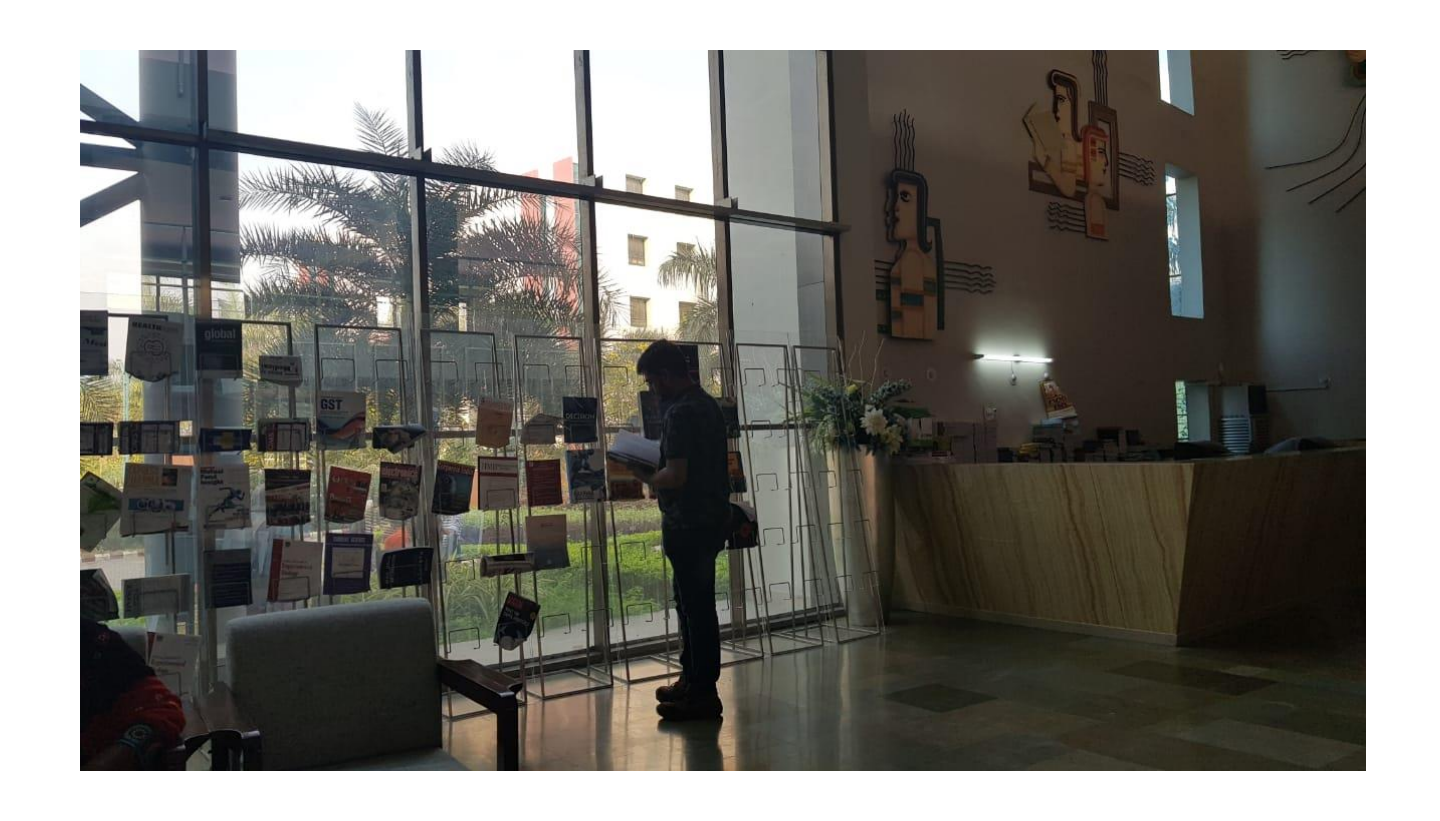
7. Shreemad Rajchandra Museum