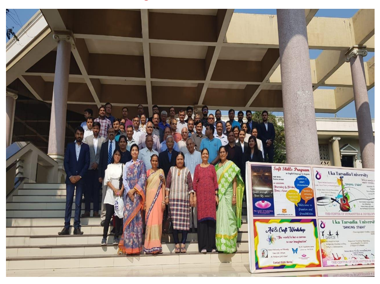
Engineers' Association of Vapi with Organizing Committee of UTU