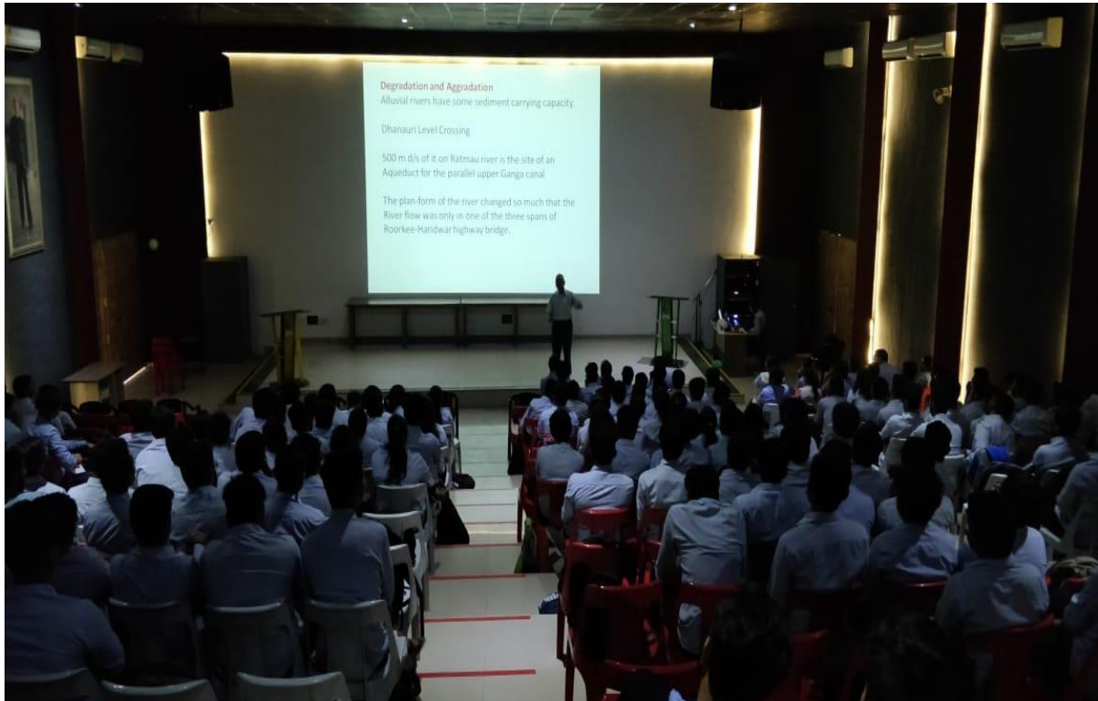
Students view during the session