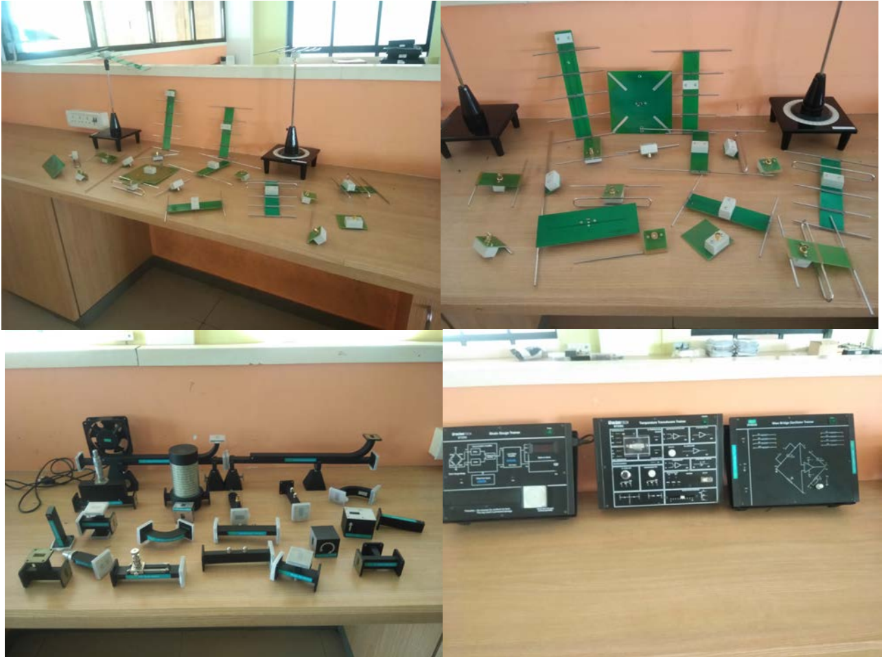
Different Microwave Laboratory Component