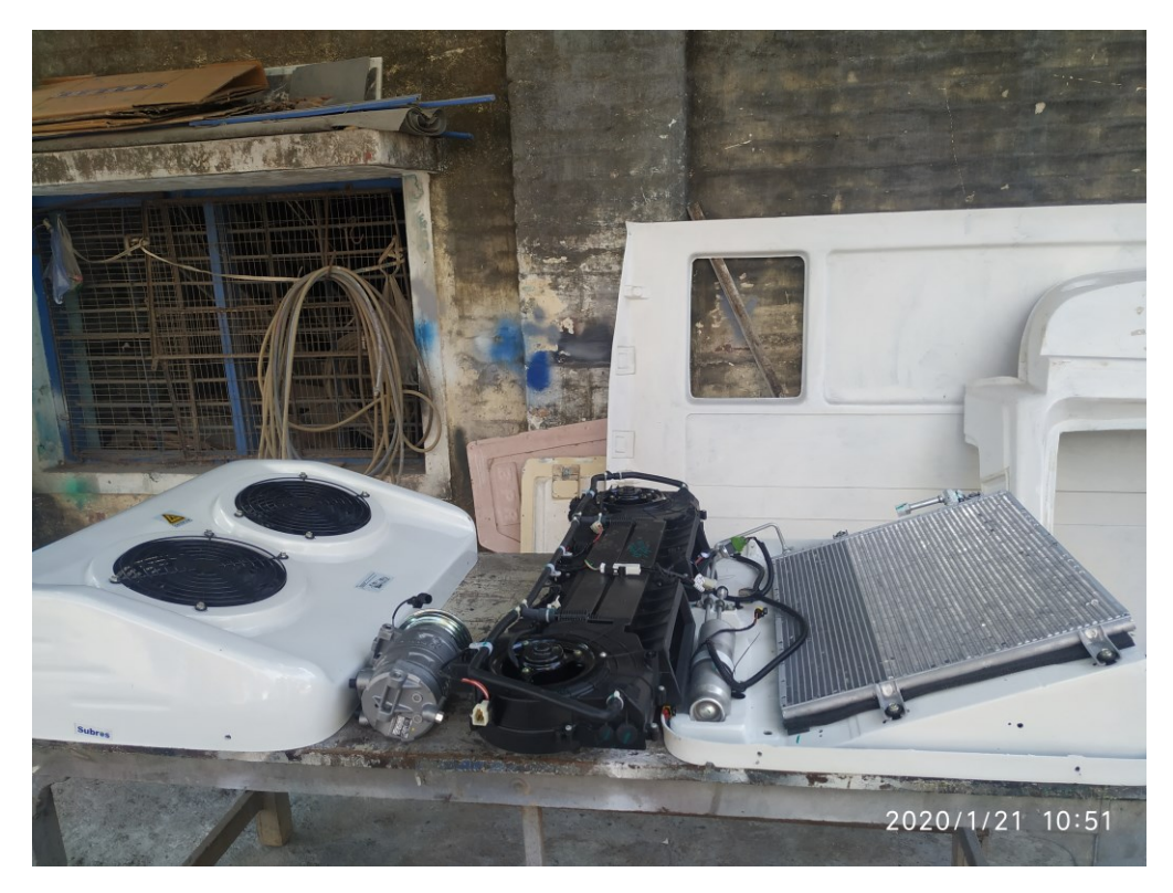
Components of Automobile AC System