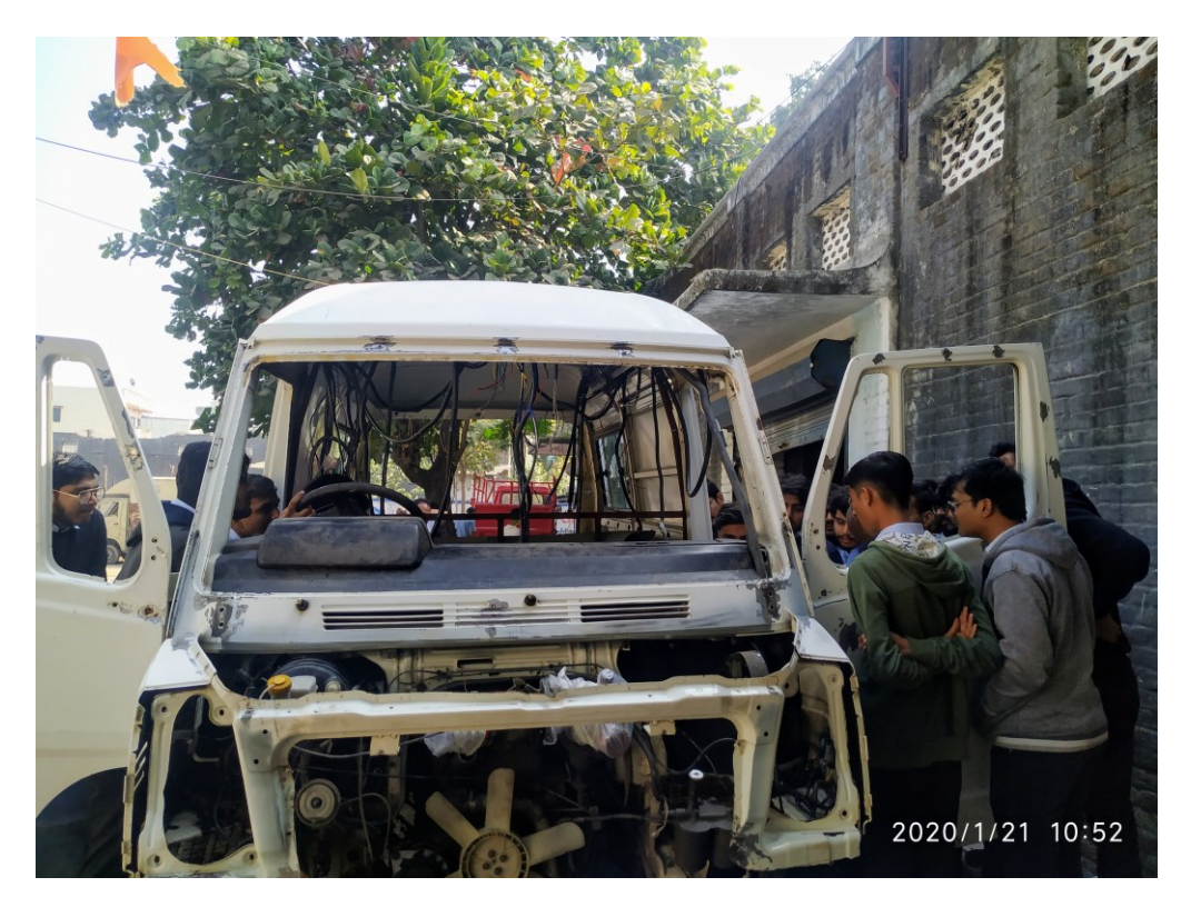
Wiring of Auto AC system