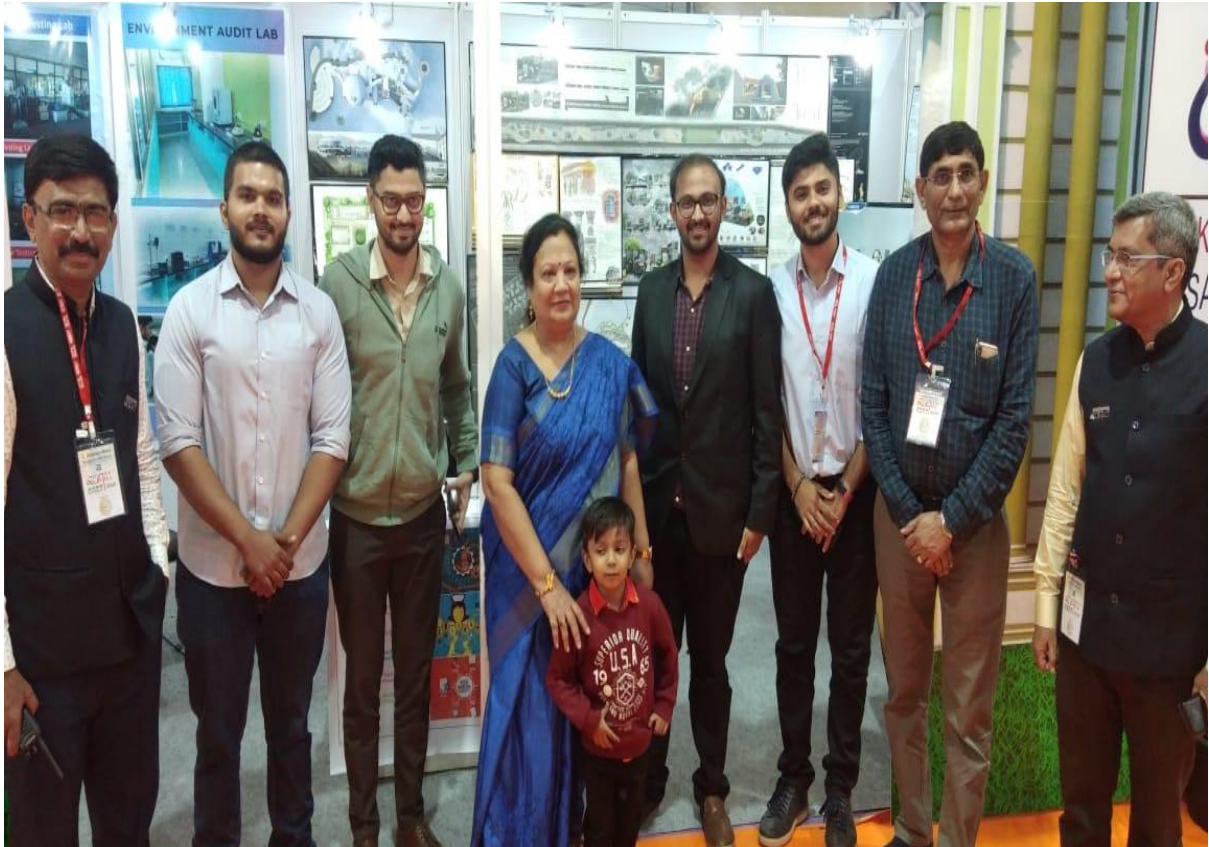
Team UTU at Sthapatya- 2020 with Smt. Darshnaben Jardosh- MLA, Surat