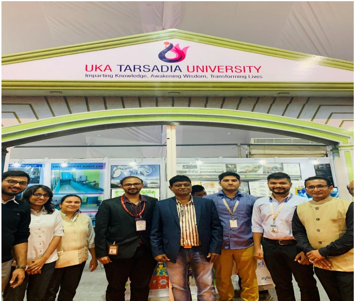
Team UTU at Sthapatya- 2020 with President ICEA