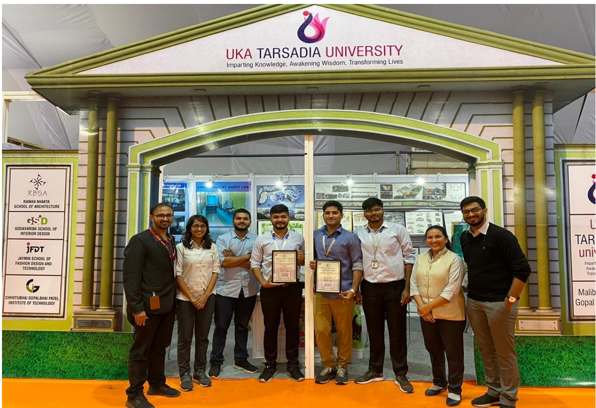
Team UTU at Sthapatya- 2020 with Student and Faculty Coordinators receiving Certificate of Appreciation