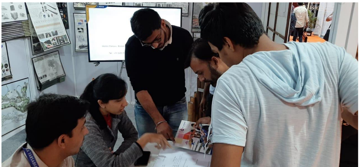
Overwhelming Response and Appreciation to Valuable work of Students