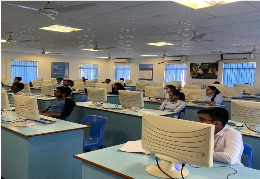
Participants during session