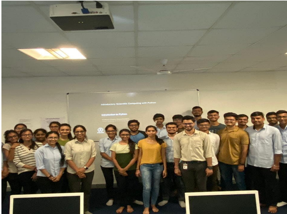
Participants with Workshop Coordinators