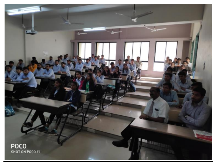
During the talk