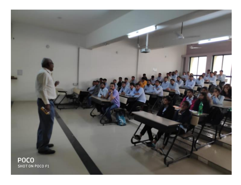
During the talk