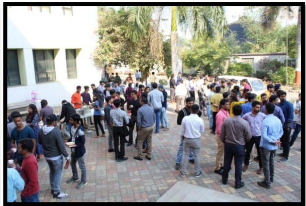
Alumni Enjoying Breakfast