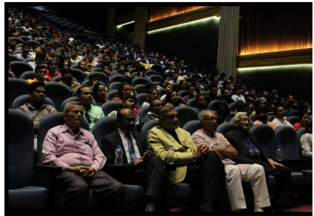
Dignitaries and Alumni in P. T. Auditorium

Alumni of previous six batches from diploma, undergraduate and post graduated were invited, and total 310 alumni were present on that day.