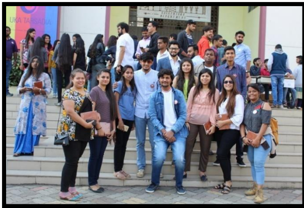
Alumni Students at Registration Desk with Gift

The Alumni started arriving in college by 9.00 A.M., and they were received by the registration team. The alumni students were given executive diary and badges of Alumni Meet as a token of love at the registration desk. The registration process followed by the breakfast. All the faculties and the alumni students than proceed towards the Pushpam Tarsadia Auditorium for the inaugural ceremony.