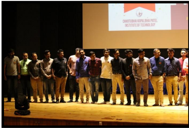
First Admitted Batch Alumni