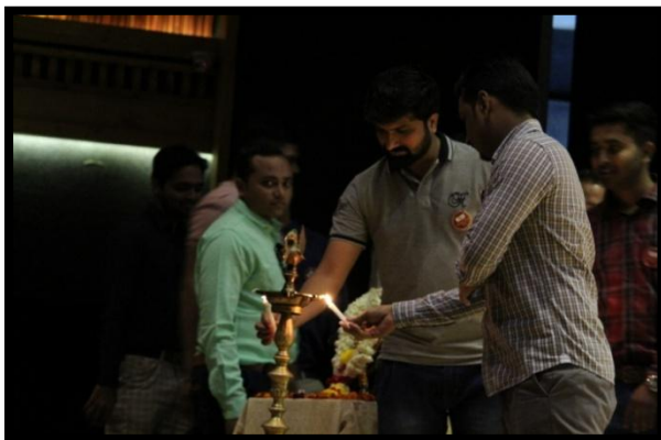
Lamp Lighting by Alumni