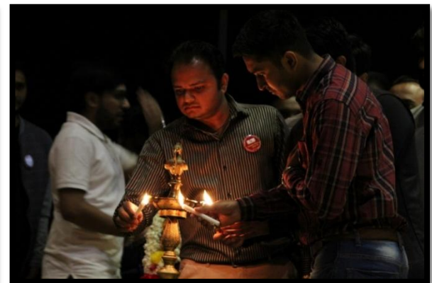
Lamp Lighting by Alumni