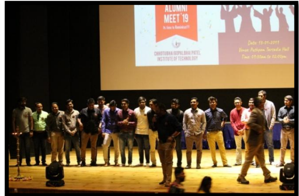
Alumni Giving Feedback on Meet