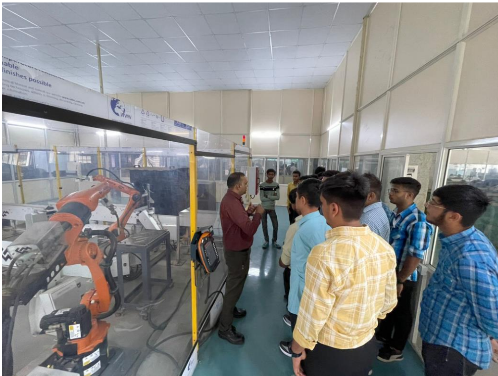
Workshop on Robotics at IGTR, Ahmedabad