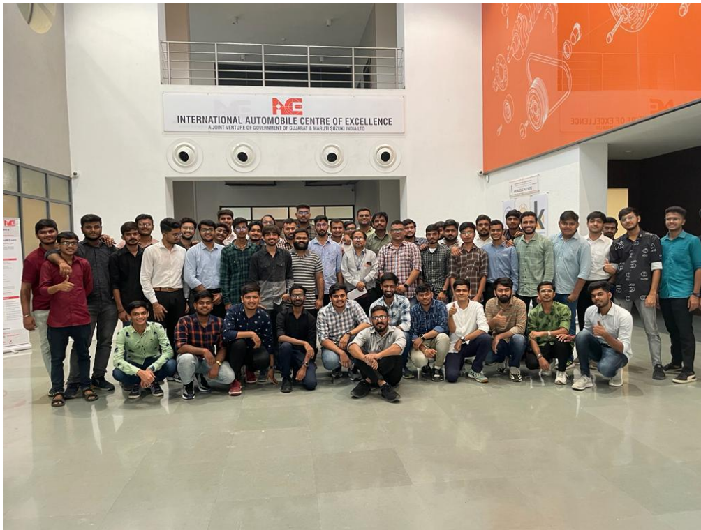
Group photo at iACE Gandhinagar