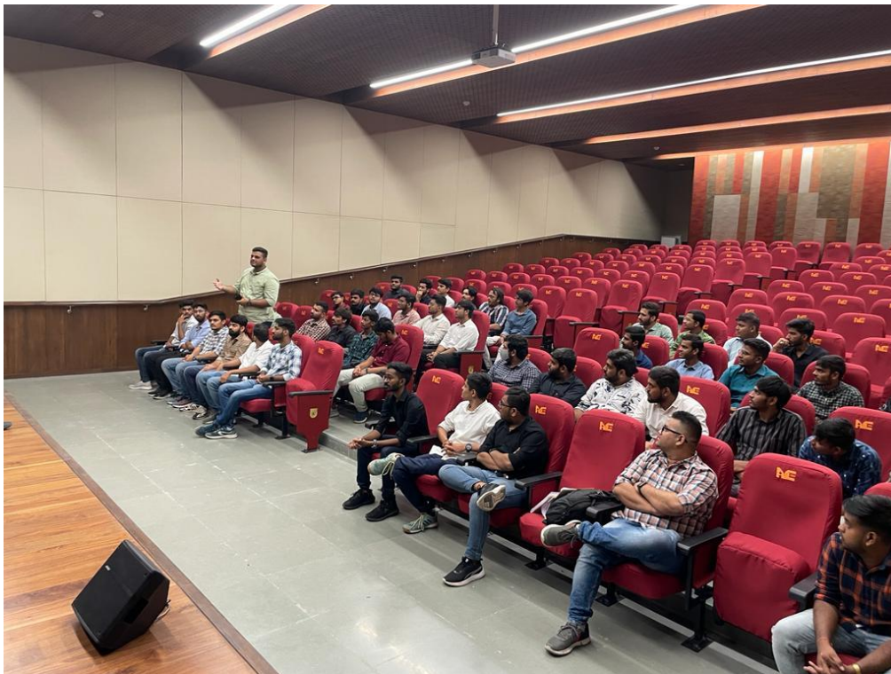
Pre visit session at iACE