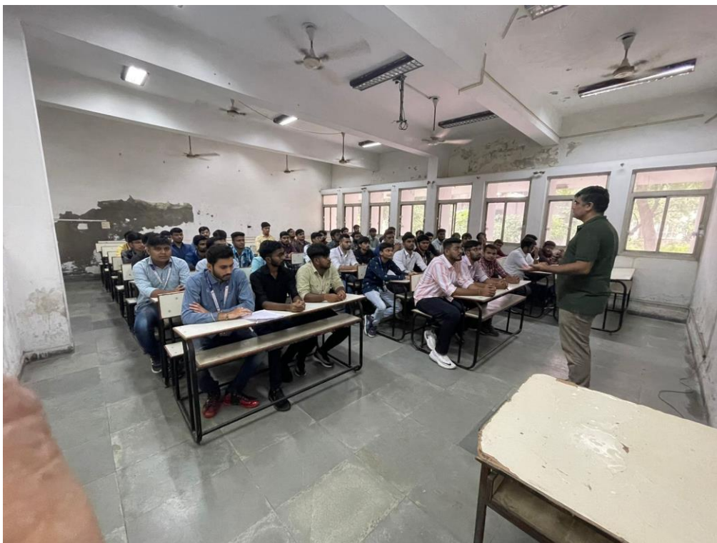
Pre visit talk at IGTR