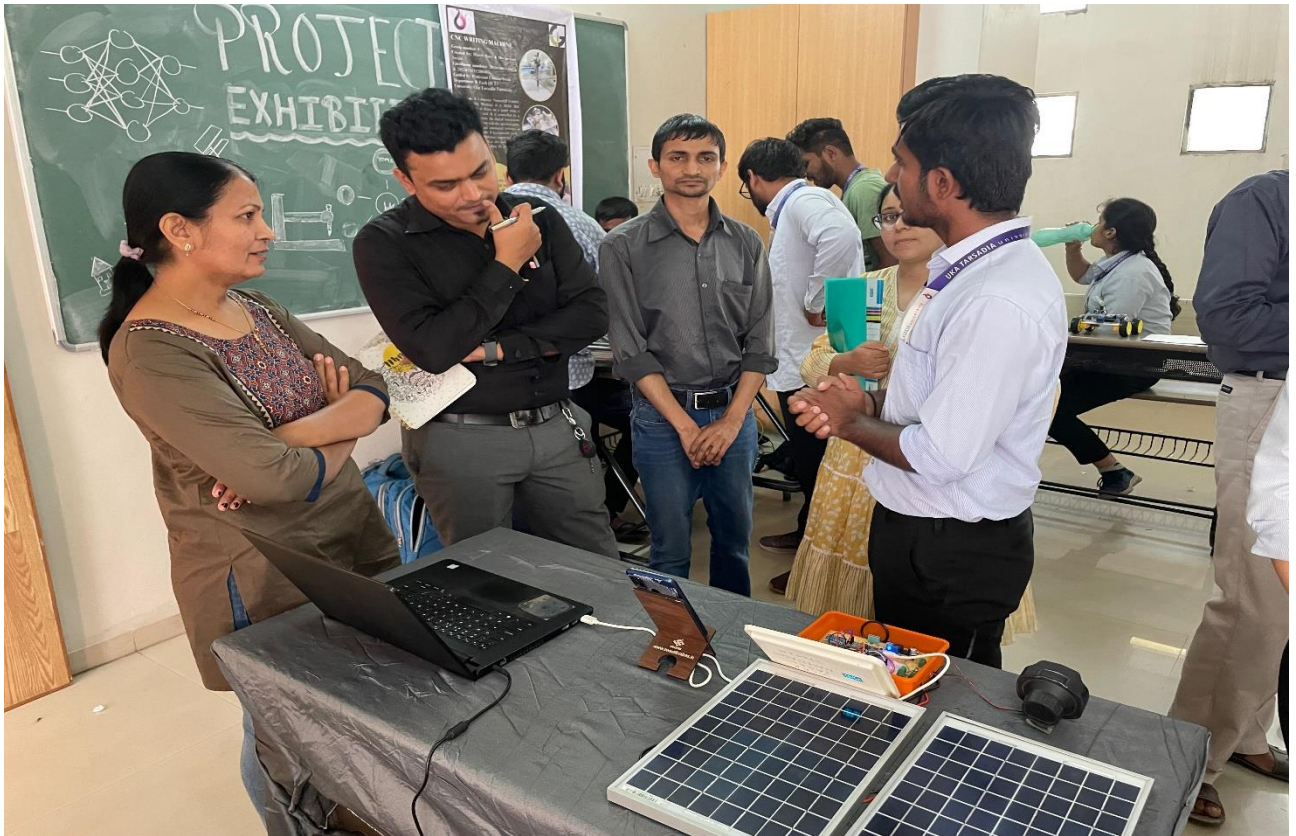
Student doing Demonstarion of his Project Work