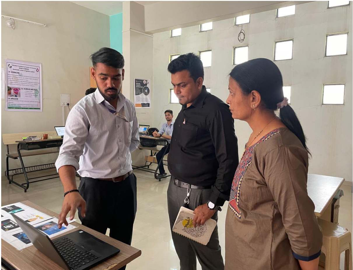
Student is explaining about his project work to the jury member