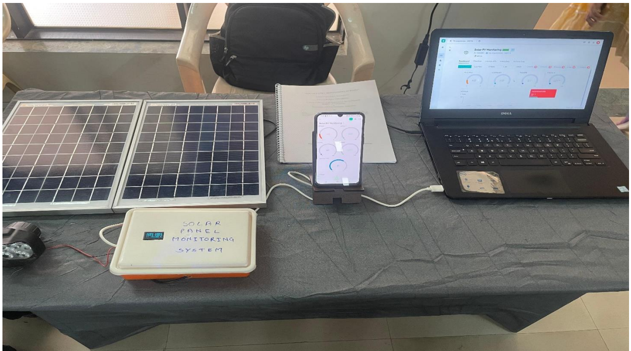
Project Work Carried out by a Student