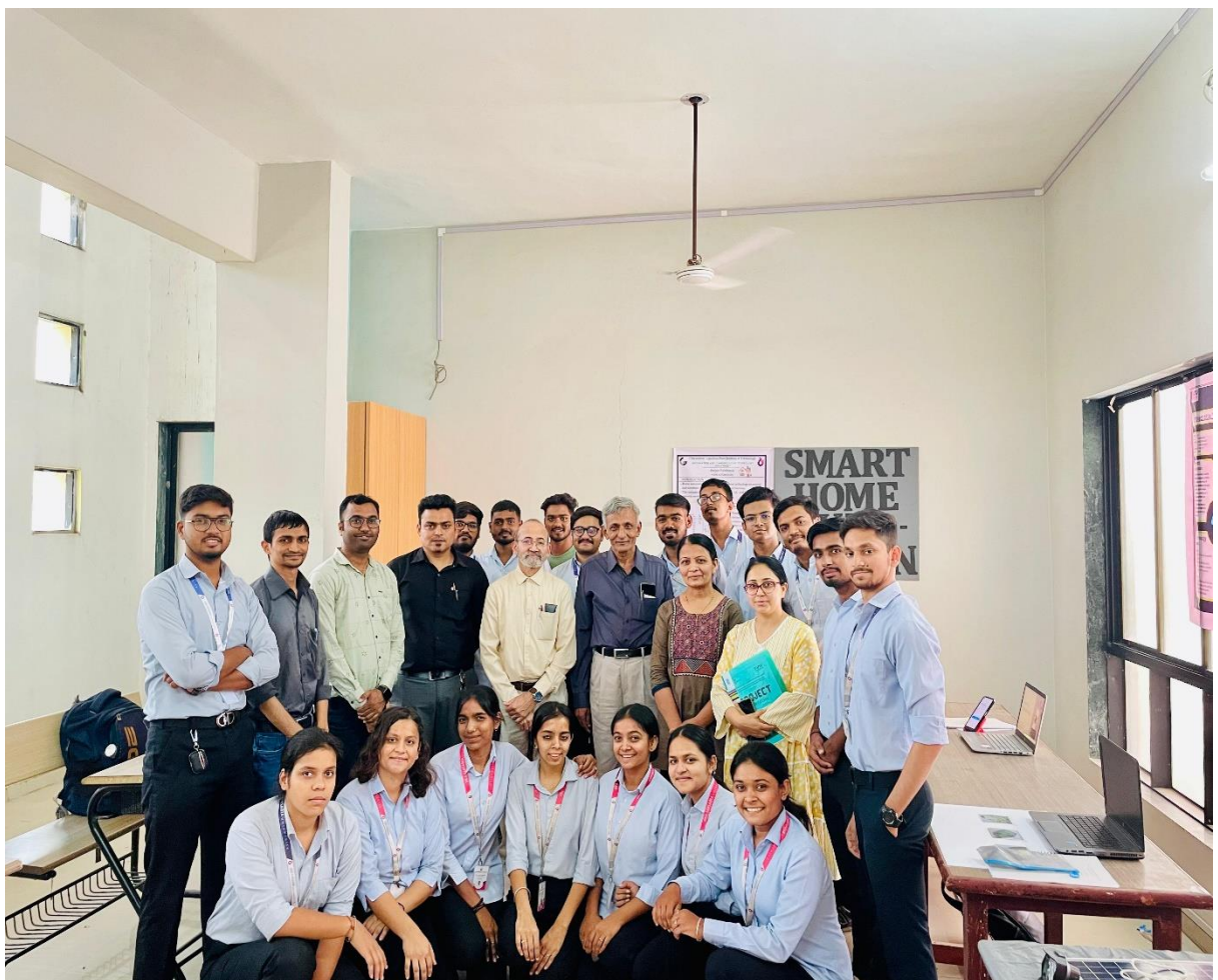
Group Photograph with Students, Faculty Members, Jury Member and Director, CGPIT