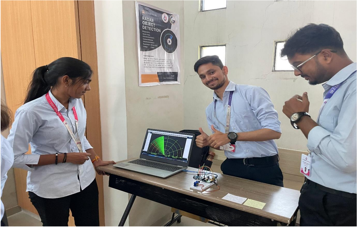
Project Demonstration by a Group of Students