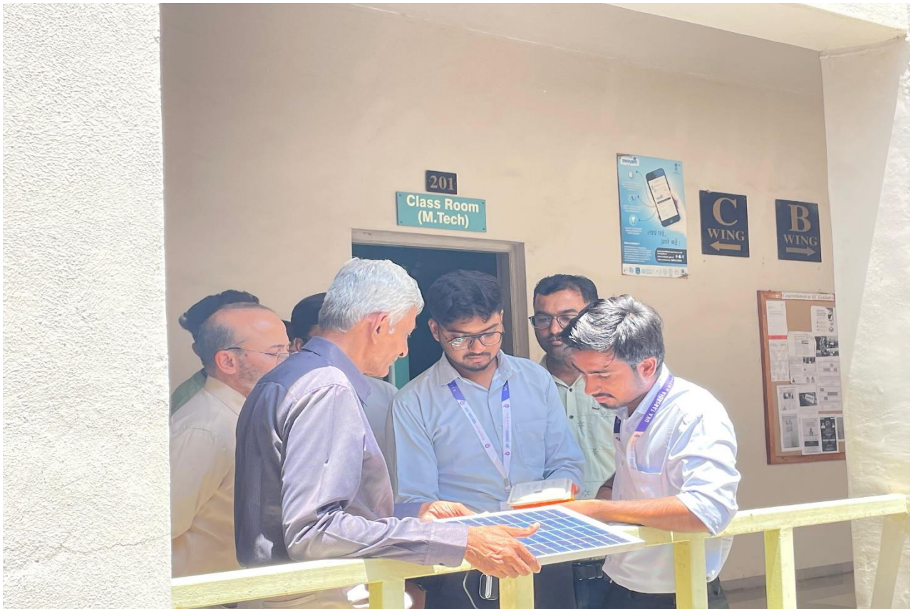
Student doing Demonstarion of his Project Work