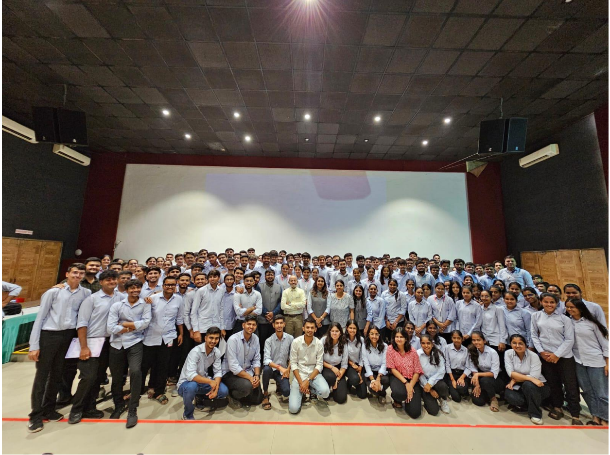
Pictures with all the participants, coordinators, faculties, expert and Director sir